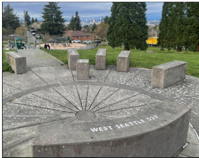
Myrtle Reservoir Lookout