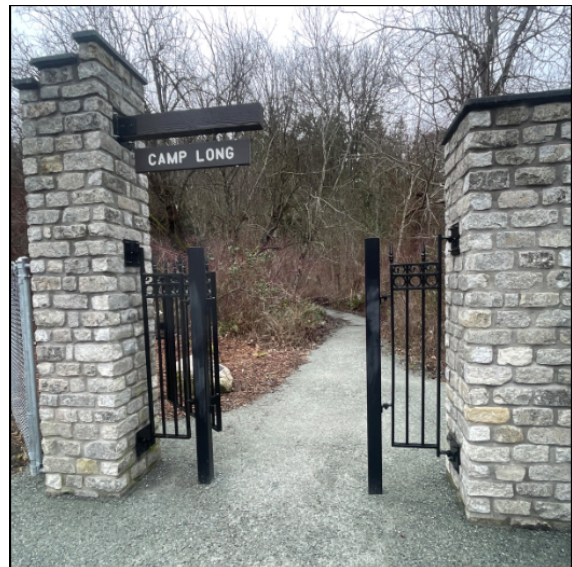
South gate Camp Long